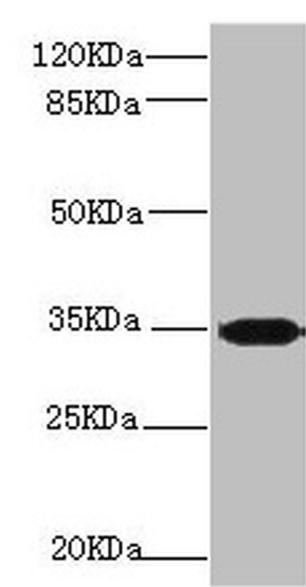
PLSCR1 Antibody (PA5-98064) in WB Western Blot analysis of PLSCR1 using a PLSCR1 Polyclonal antibody (Product # PA5-98064) at a concentration of 2.24 µg/mL. Positive WB detected in 293T whole cell lysate. A secondary Goat polyclonal antibody to rabbit IgG was applied at a 1:10,000 dilution. Observed band size: 36 kDa.