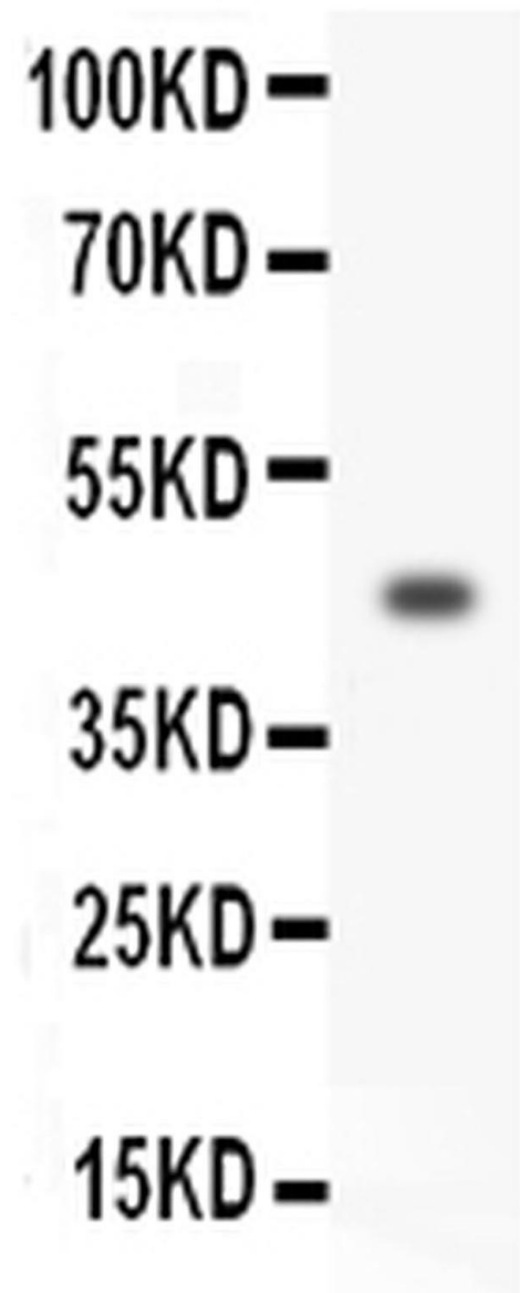
HOXA3 Antibody (PA5-79388) in WB Western blot analysis of HOXA3 in SW620 whole cell lysate using 40 µg per well. Sample was incubated with HOXA3 (Product # PA5-79388) at a dilution of 0.5 µg /mL.