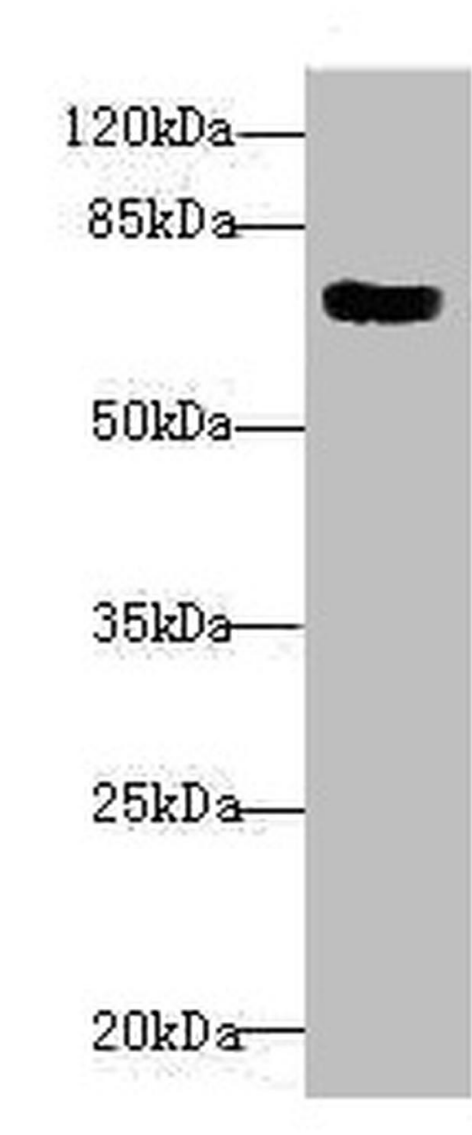
MTGR1 Antibody (PA5-97543) in WB Western Blot analysis of MTGR1 using a MTGR1 Polyclonal antibody (Product # PA5-97543) at a concentration of 1.82 µg/mL. Positive WB detected in 293T whole cell lysate. A secondary Goat polyclonal antibody to rabbit IgG was applied at a 1:10,000 dilution. Observed band size: 68 kDa.